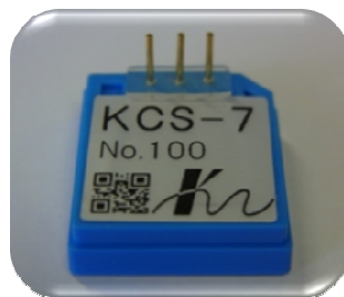
Fig. 1 Sensor image